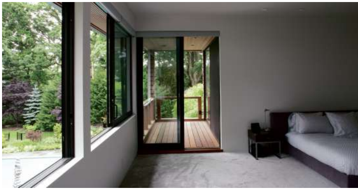
DOUG KAPLAN'S FOCUS:

"We wanted to enjoy the property, and bring greenery and natural light and color in. Facing south, with almost continuous glass on the first floor, we also wanted to use the sunlight for passive heating."